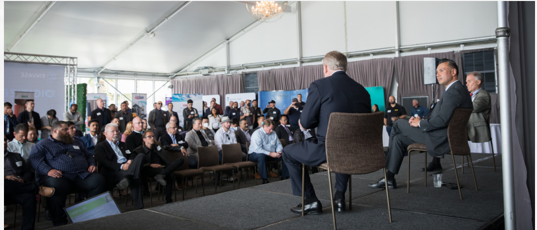
Photo from DrayTECH2022 during the State of the West Coast Ports Panel.

MAY 19TH, 2023 | DOUBLE TREE HOTEL | SAN PEDRO, CA