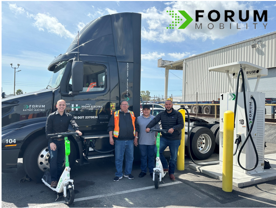
Brought to you by Forum Mobility

Agreement will shift an anticipated 300+ port-to-hub shipments per year to fully-electric zero-emission trucks