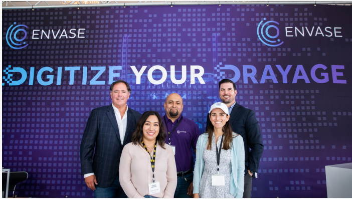
Photos taken during DrayTECH 2022 of Envase Technologies Team at Hotel Maya in Long Beach.